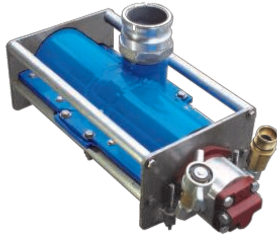
Model FF 3 A LL

Fast Flow's "Low Level" Pumps with twin bottom suction are ideal for confined entry, tank and barge cleaning. Alone, these pumps move fluid down to 1" in the tank. When this pump is coupled to a vacuum truck virtually all of the fluid can be removed. The Fast Flow Low Level Pump easily handles heavy weight mud and solutions without the clogging that plagues traditional diaphragm pumps. When combined with a 3D wash-down system, confined entry cleaning becomes faster and safer.