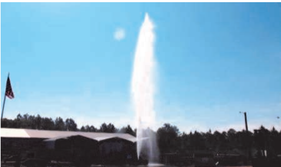
75' Jet of water from a 3" Low Level Pump and a 1" discharge coupling

The Fast Flow Low Level Pump can pump down to less than 1" . This revolutionary pump technology moves heavy solids better than traditional centrifugal pumps & can replace virtually an arsenal of air diaphragm pumps. When this pump is coupled to the suction of a vacuum truck, virtually all of the fluid can be evacuated.