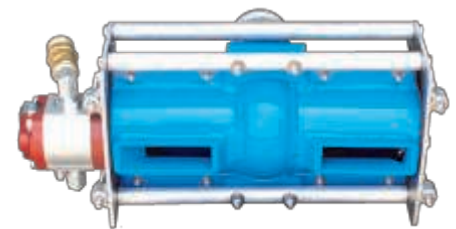
Fast Flow "low level" pump dual bottom inlets